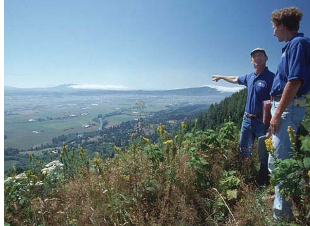
Watershed observations, photo courtesy of NRCS

Everyone lives in a watershed. The boundaries of a watershed are defined by the topography of the earth and how gravity channels water into aquifers, streams, rivers, lakes and oceans. A watershed can be as large as the area east of the Continental Divide or as small as a few-acre marsh located along a seashore. But no matter how large or small your watershed is, someone or something is affected by the wastewater you release downstream. And unless you collect purified rainwater to drink, your water has been affected by someone or something upstream.